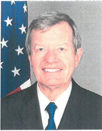
11th United States Ambassador to China